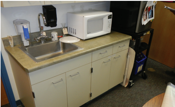
Staff Work Room / Lounge