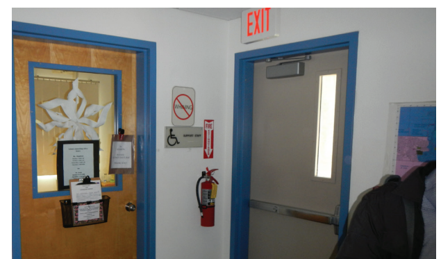
Exterior Door Hardware