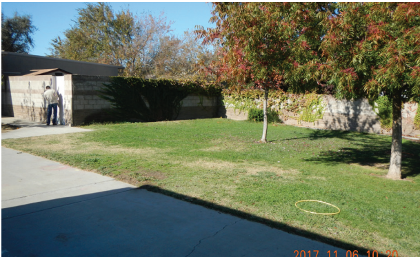
Playfields / Athletics