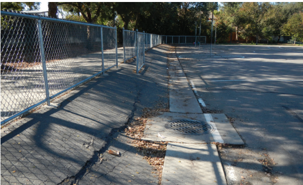
Fencing / Gates